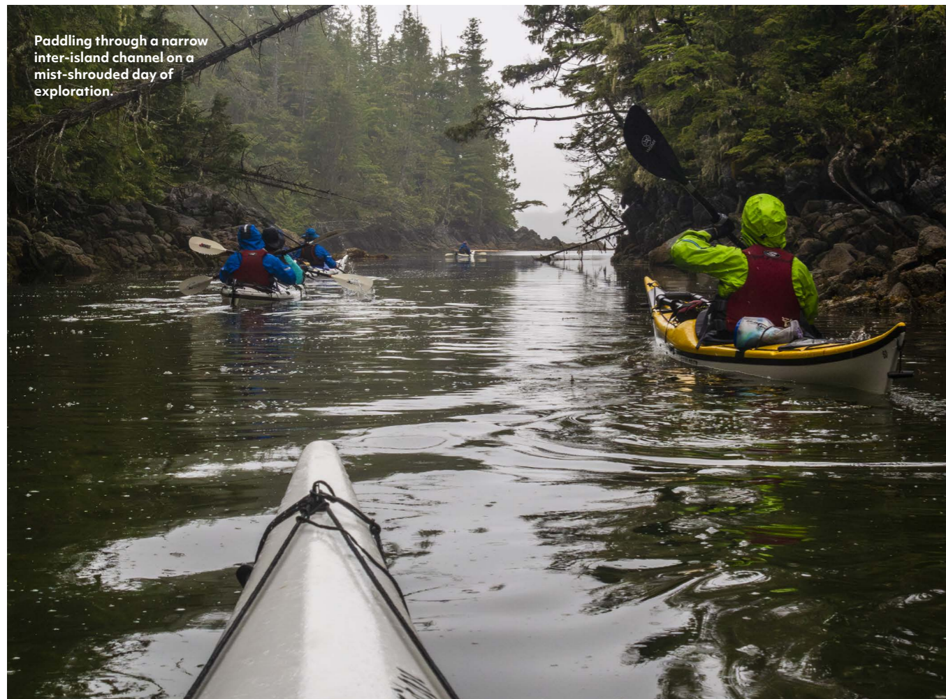
Paddling through a narrow inter-island channel on a mist-shrouded day of exploration.