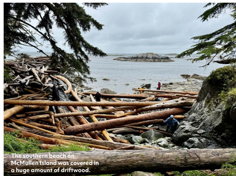
The southern beach on McMullen Island was covered in a huge amount of driftwood.