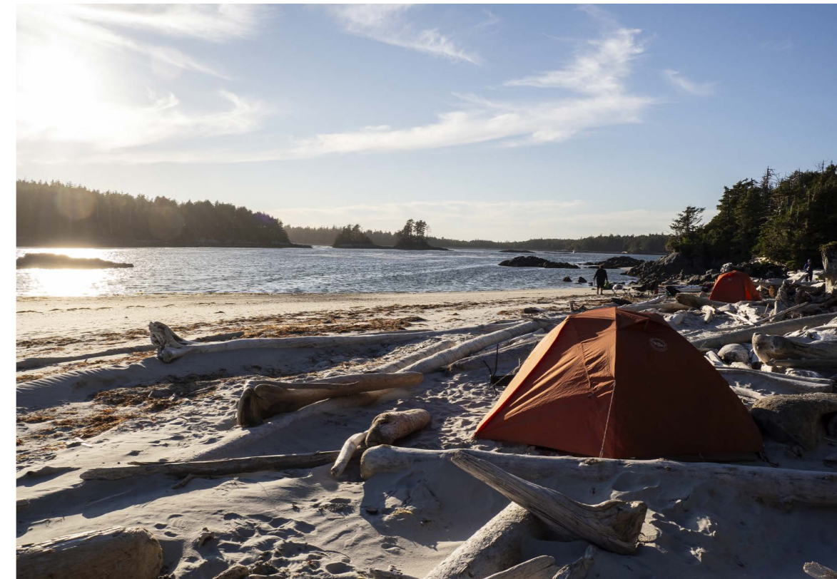
Last camp at Snipe Island showcased all that is amazing about camping and paddling in this region.